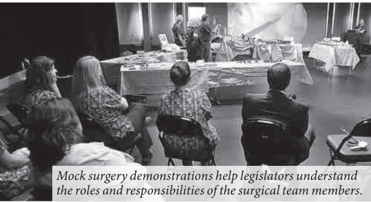
Mock surgery demonstrations help legislators understand the roles and responsibilities of the surgical team members.